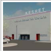
Dream comes true