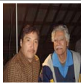
Boyhood dream comes true with N.M. actor's 'Ultima'