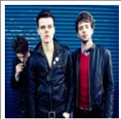
Dream comes true as hero comes calling